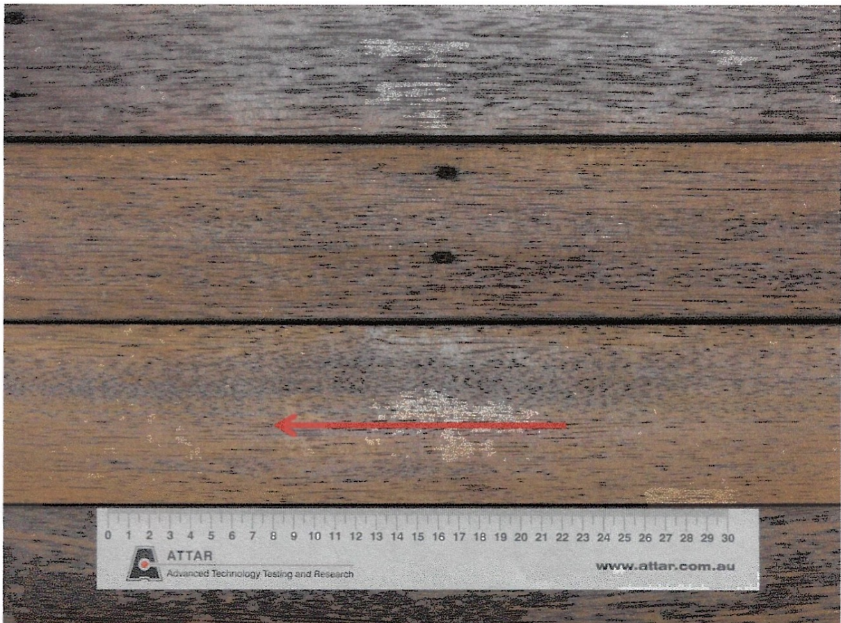
Figure 1: Universal Decking Oil applied to timber decking Arrow indicates direction of testing