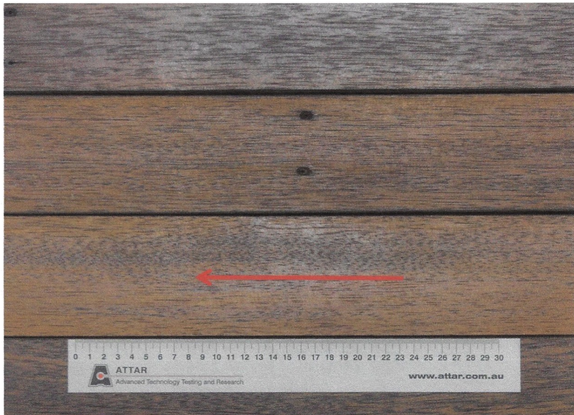
Figure 1: Universal Decking Oil applied to timber decking Arrow indicates direction of testing